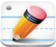
Write My Name by NCSOFT