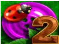
Bugs & Buttons 2 by Little Bit Studio, LLC