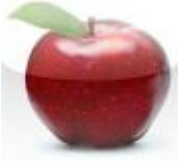
Toddler Flashcards by iTot Apps, LLC