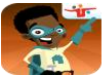
Super Home Hero by Fred Rogers Center at Saint Vincent College