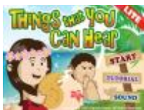
Things You Can Hear Lite by Captive Games