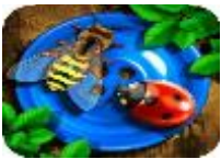
Bugs & Buttons by Little Bit Studio, LLC