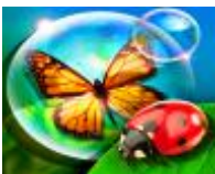
Bugs & Bubbles by Little Bit Studio, LLC