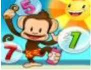
Monkey Math School Sunshine by THUP Games