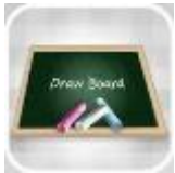
Draw board by @Huizhe