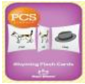
PCS Rhyming Flash Cards by DynaVox Mayer-Johnson Education