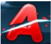
ABC Ninja by Innovative Mobile Apps