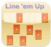
Line em Up by Classroom Focused Software