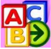
Starfall ABCs by Starfall Education, LLC