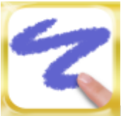
Doodle Buddy by Pinger, Inc.